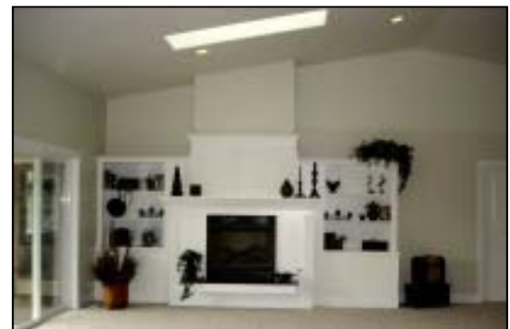
GREAT ROOM FIREPLACE