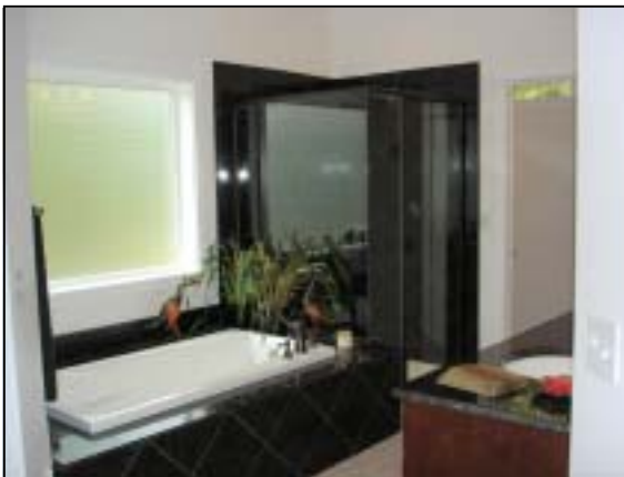
PART OF THE MASTER SUITE BATH