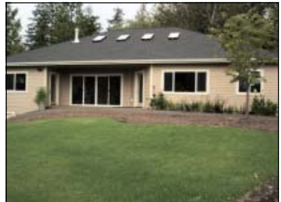
BACK VIEW SHOWING COVERED PORCH, FULLY LANDSCAPED YARD & SKYLIGHTS IN GREAT ROOM AND KITCHEN