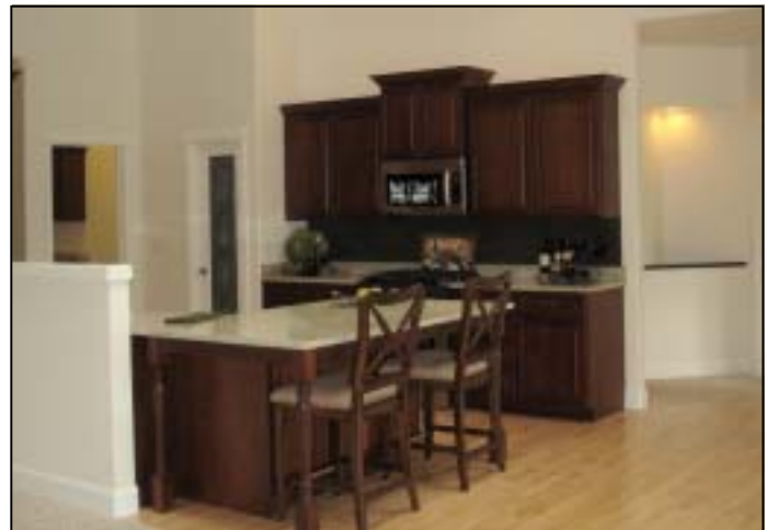
KITCHEN WITH BREAKFAST BAR